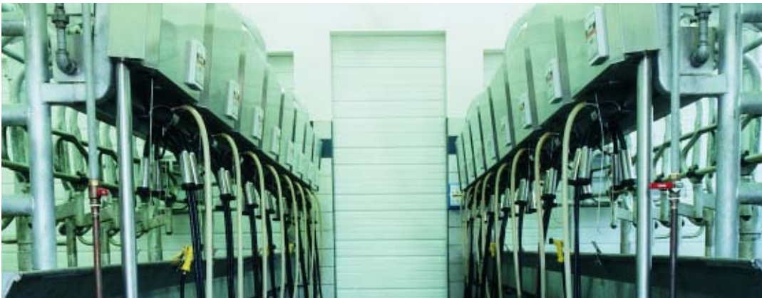
Brunmeir Dairy Farm, Inc., Newton, Wisconsin, Double 8.