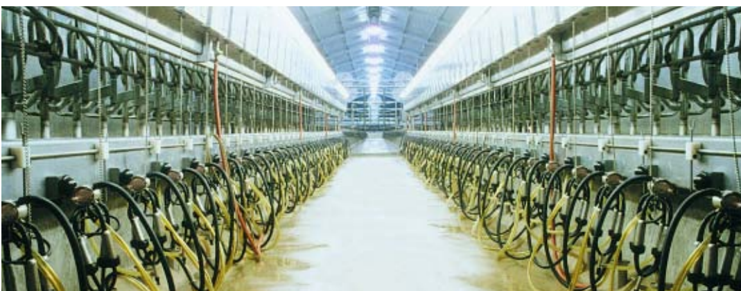
DeJager Dairy, Chowchilla, California, Double 40.