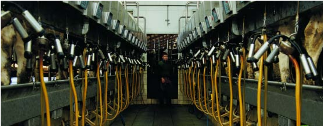
Enge Farms, Baraboo, Wisconsin, Double 16.

Parlor planning assistance — WestfaliaSurge will design a floor plan to meet your needs exactly. Give us your specs and we'll prepare the blueprint.